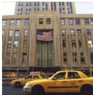
The Empire State Building outside entrance

While it doesn't take much imagination to keep yourself busy in New York during the time you're not studying, Kaplan provides a varied calendar of activities to fill your days. With workshops, parties, walking tours, museum trips, sporting events, Broadway shows and more, you'll discover parts of New York you didn't even know existed! These activities are lead by a member of the Kaplan staff and will help you to meet new people and discover the city.