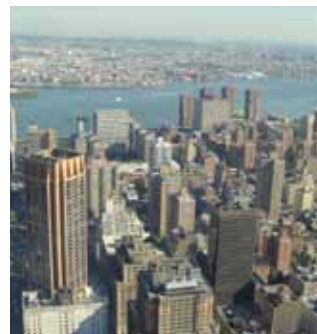
View from a classroom