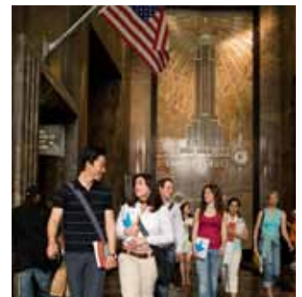
Empire State Building - Reception