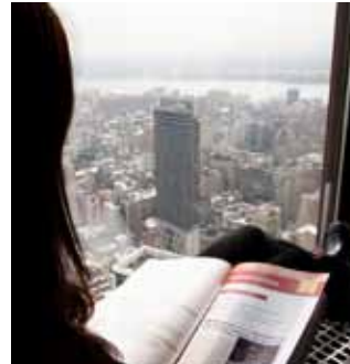
Bright and spacious classrooms with amazing views of the city

Telephones are located outside The Empire State Building. There is an Internet Café across the street from the center. The Internet is also available at center for free and the center has wireless Internet access.