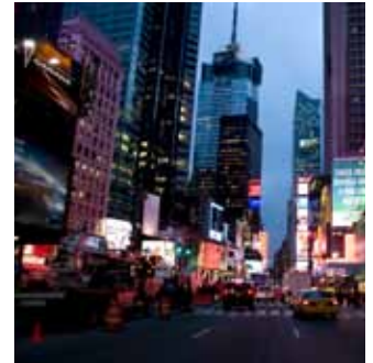
New York at Night