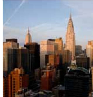
New York Skyline

While it does not take much imagination to keep yourself busy in New York during the time you're not studying, Kaplan provides a varied calendar of activities to fill your days. With workshops, parties, walking tours, museum trips, sporting events, Broadway shows and more, you'll discover parts of New York you didn't even know existed! These activities are led by a member of the Kaplan staff and will help you to meet new people and discover the city.