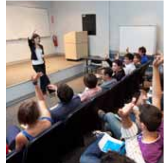
East Village Classroom